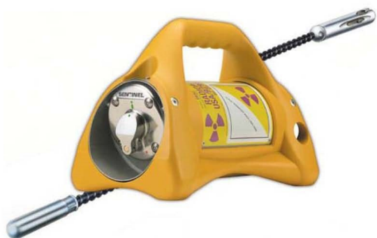
Example Iridium Radiography Projector

The Iridium radioactive source is only about the size of the end of a pencil