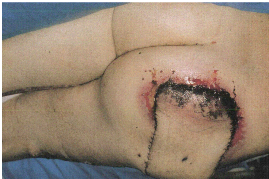
Skin flap sewn on