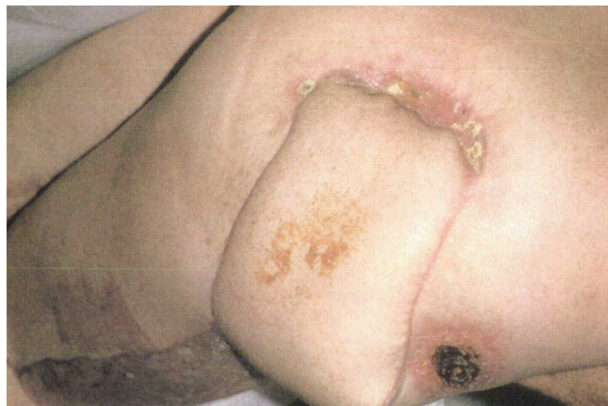
19 months after incident